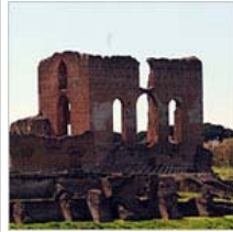
The Past Catches Up With the Queen of Roads