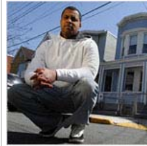
Taking the Pulse of the Boroughs