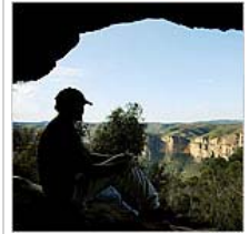
Australia's Blue Mountains