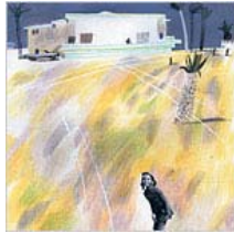
In Search of a Lost Africa