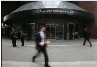
Enlarge

A man passes by an American International Group office building Monday in New York City. AIG used billions in federal aid to pay foreign banks, highlighting the expanse of the global financial system.