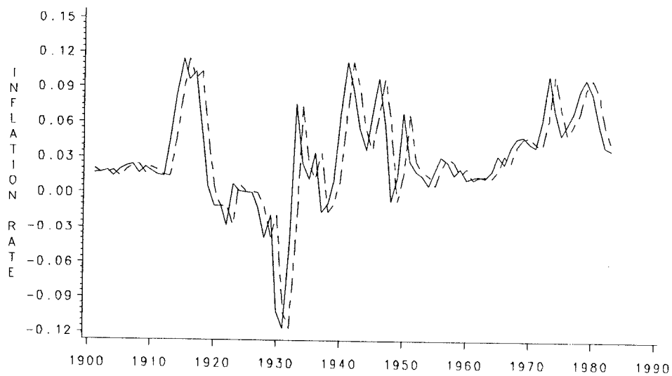
Fig. 22. Actual and Forecasted Inflation: Bond Based and Random Walk Models: Annual Data. The line represents Actual Inflation and the dash represents the Bond Forecasts (top panel) and Random Walk Forecasts (bottom panel).