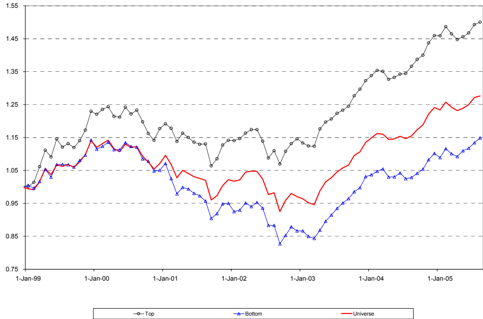
Figure 8. Equally Weighted Performance of Top & Bottom Quintiles