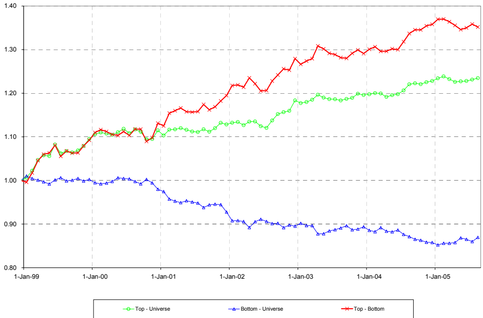
Figure 9. Quintile Wealth Curves (Top–Universe; Bottom–Universe and Top–Bottom)