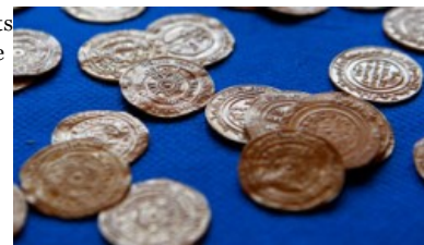
Gold coins from an archaeological discovery in Israel

That's happened before, namely the First World War. Rogoff refers to a study published in January of the economists Claude Erb and Campbell Harvey, different models investigated in order to try to get away from such a matter paste to a more or less correct appreciation for the gold core a reliable value on the price of gold . That was, however, always to fail. In practice, the gold price sometimes years to move. Above or below that calculated fundamental value Erb and Harvey argued this with other asset classes fixed, but the movements in the gold price were even more pronounced.