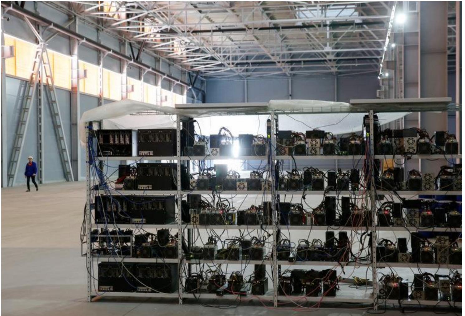
"Cryptowalert mine" located in the former Soviet car plant near Moscow

If one is a technology enthusiast, he himself wants to focus on and engage in mining, as much as possible to acquire such equipment and to exploit cryptanalysts on his own. However, it should be borne in mind that this will involve not only the purchase of machines but also the energy consumption charges. It is also impossible to forget the necessary knowledge about the virtual money market and the knowledge of algorithms.